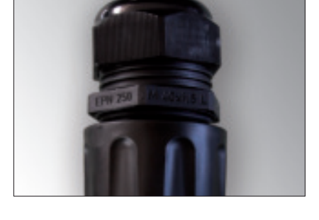
LARGER O.D. CABLE

Each connector type has a unique keyed position. Visual identifications are easily made by means of the color insulator.